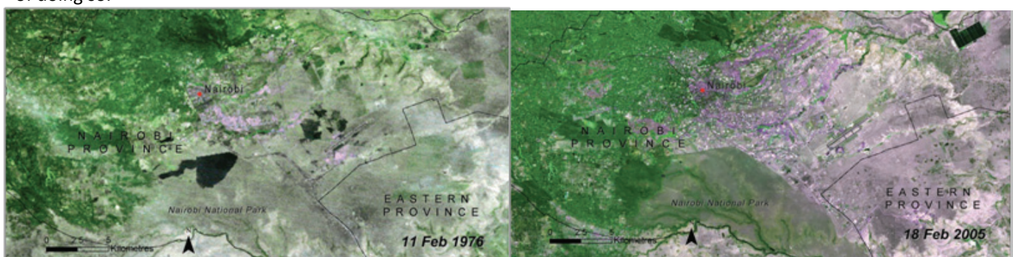
Figure 3: The Gazetted boundaries of NNP have proven to be effective barriers to land-use change within the protected area

Second, these historical boundaries demarcate but a small portion of the broader natural system, and the protection they afford does not extend to the adjacent areas of high conservation value. Seasonal wildlife migration extends to the south, where traditional pastoral practice has largely maintained the open space necessary for the viability of these movements. Today though, this migration is hindered by incremental land changes to land-use outside NNP, and the formal territory of this protected area is alone insufficient to guarantee the healthy function of its ecosystem.