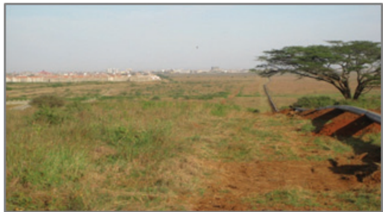
Figure 2: New oil pipeline (now buried) inside NNP

Historically, the Athi-Kapiti plains have been home to Maasai pastoralists, who grazed their cattle on communally owned lands. In recent years though, urban pressures have raised the price of land, and thus incentivised the sale of individual plots. With less land available for grazing, Maasai pastoralists are less able to avoid the predators they'd traditionally co-existed beside. At the same time, the increasingly fragmented landscape renders pastoralism less viable, reinforcing the incentive to sell.